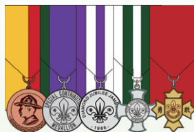
Fig. 2: 4 or more Medals