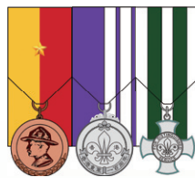
Fig. 1: 2 to 3 Medals